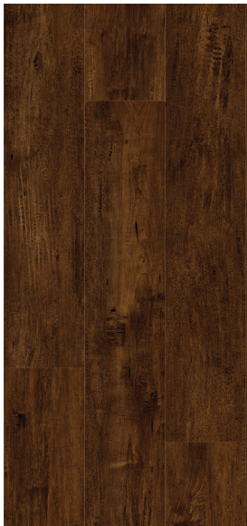
LI-CH08 City Pointe