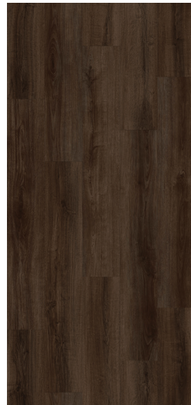
LI-CH13 River Walk