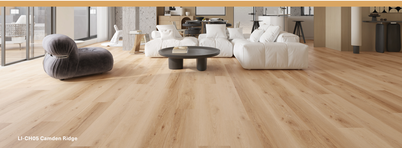
LI-CH05 Camden Ridge