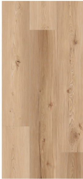
LI-CH05 Camden Ridge