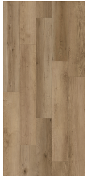
LI-CH14 Maple Gardens