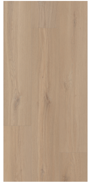
LI-CH07 Country Aura