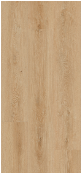
LI-CH01 Village Park