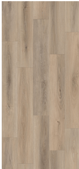
LI-CH10 Cedar View