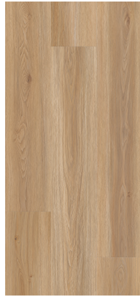
LI-CH06 Huntington Gardens