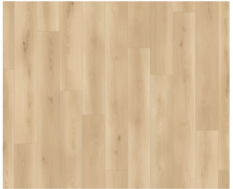
LI-CC06 Wilderness Whispers