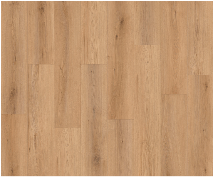
LI-CC01 Sunset Vista