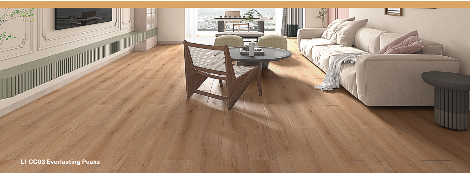
LI-CC03 Everlasting Peaks