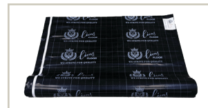
UL-MB6 Moisture/Vapor Barrier